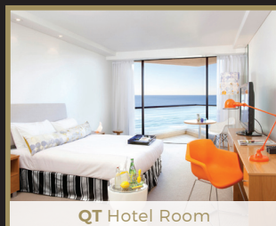
QT Hotel Room