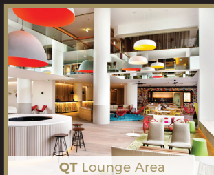
QT Lounge Area