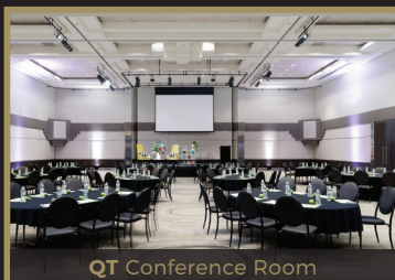
QT Conference Room